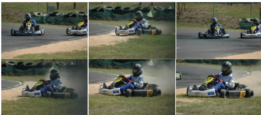
A bit of excitement during 125 Restricted.

COVER: Two Rookies going deep into the 1 st Corner during last month's racing.